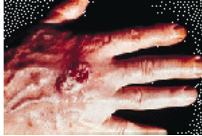
Squamous cell skin cancer